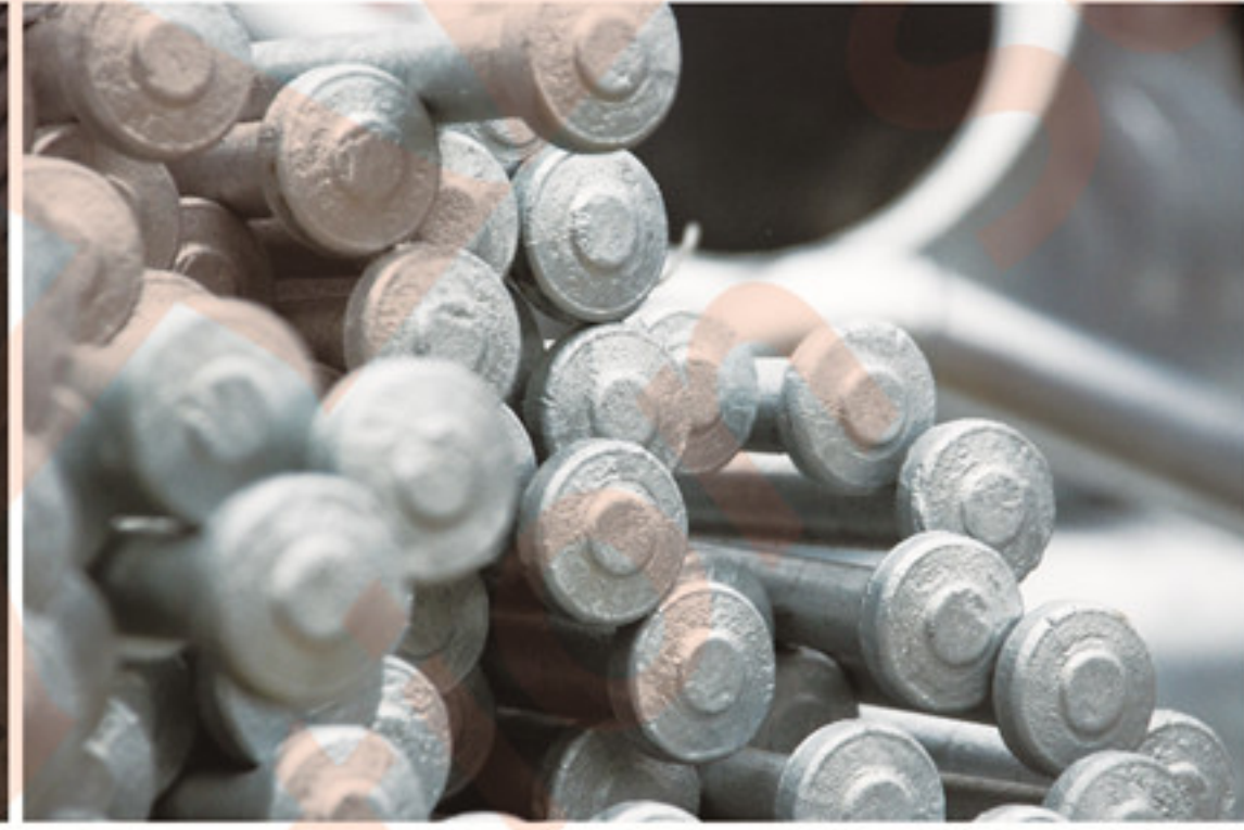
HOT DIP GALVANIZED